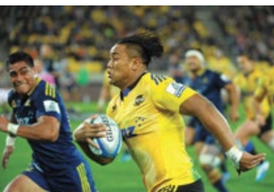
HURRICANES VS HIGHLANDERS 16 May 2014

Another full calendar year saw 61 events, which included 10 community event days held at the Stadium. The 51 major events were equaled in number only in 2011/12 since the Stadium opened. 439,638 fans streamed through the gates, our 15th successive year of crowds of over 400,000. This figure was on par with the previous financial year. Cumulative attendance at the Stadium surpassed 7.7 million.