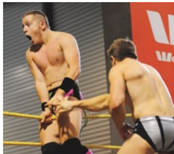
ARMAGEDDON EXPO 31 May-2 June 2014