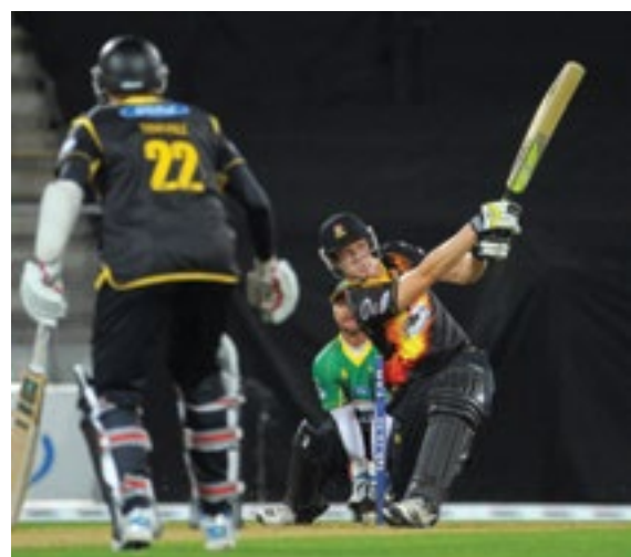
WELLINGTON FIREBIRDS V CENTRAL DISTRICTS