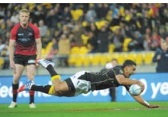
WELLINGTON VS CANTERBURY 21 September 2013