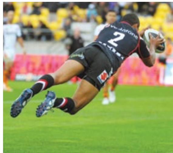
WARRIORS VS WESTS TIGERS 29 March 2014