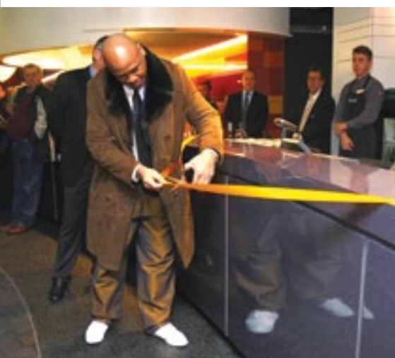
DELOITTE CLUBROOM OPENING July 2013