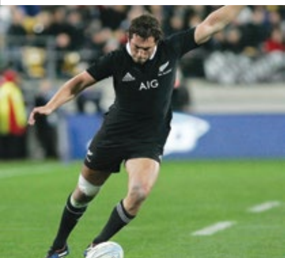
ALL BLACKS VS AUSTRALIA 24 August 2013