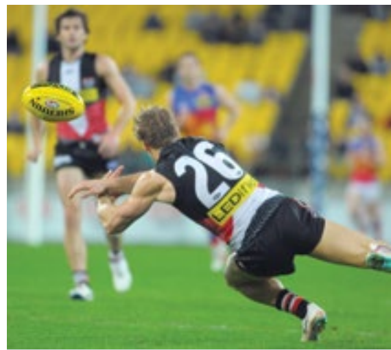
ST KILDA VS BRISBANE LIONS 25 April 2014

As the manager of a regional community asset, the Trust tries to incorporate as many community events as possible each year. We were delighted to assist with NZ Fire Service training, Sport Wellington School Sports Day, NZ Army training, the Wellington Marathon, the TV Takeback recycling programme and the PNP Cycle Club Race Day.