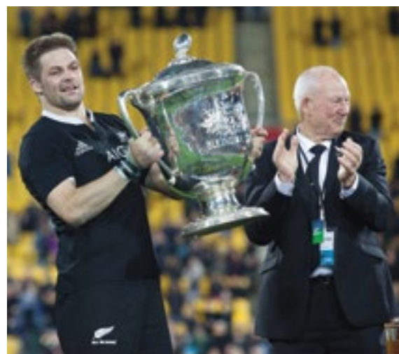
ALL BLACKS VS AUSTRALIA

Over the year we also commenced the rollout of a wet pour beer system. This was completed along the Eastern Concourse during the year and work has commenced on the Western Concourse. This will enable breweries to offer a greater range of beverages than in the past and provides a better product experience for our fans.