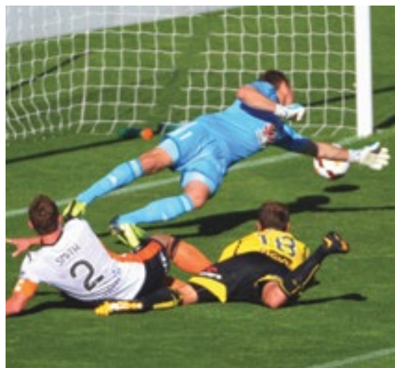
PHOENIX FC VS BRISBANE ROAR 14 December 2013