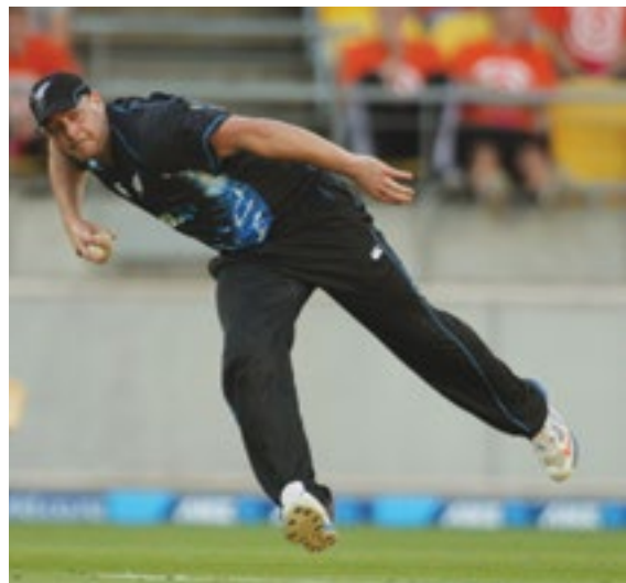
BLACKCAPS VS WEST INDIES 15 January 2014