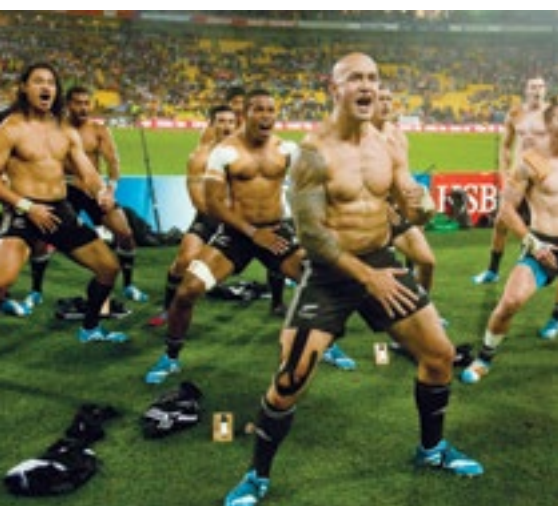
SEVENS TOURNAMENT 7-8 February 2014