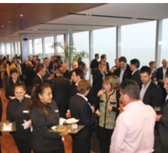
MEZZANINE LOUNGE OPENING April 2014