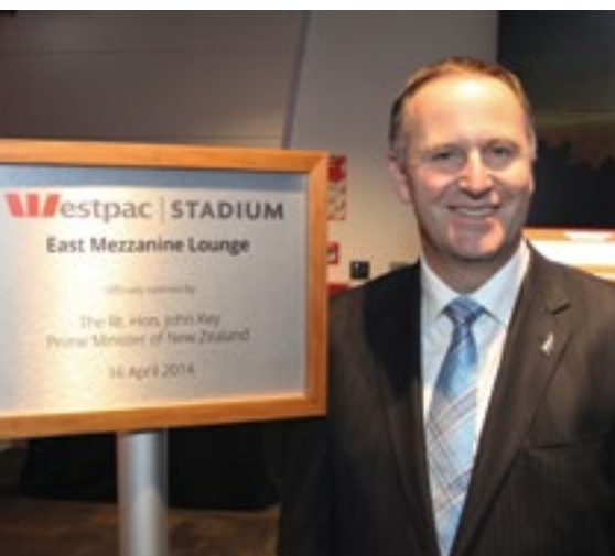
MEZZANINE LOUNGE OPENING April 2014