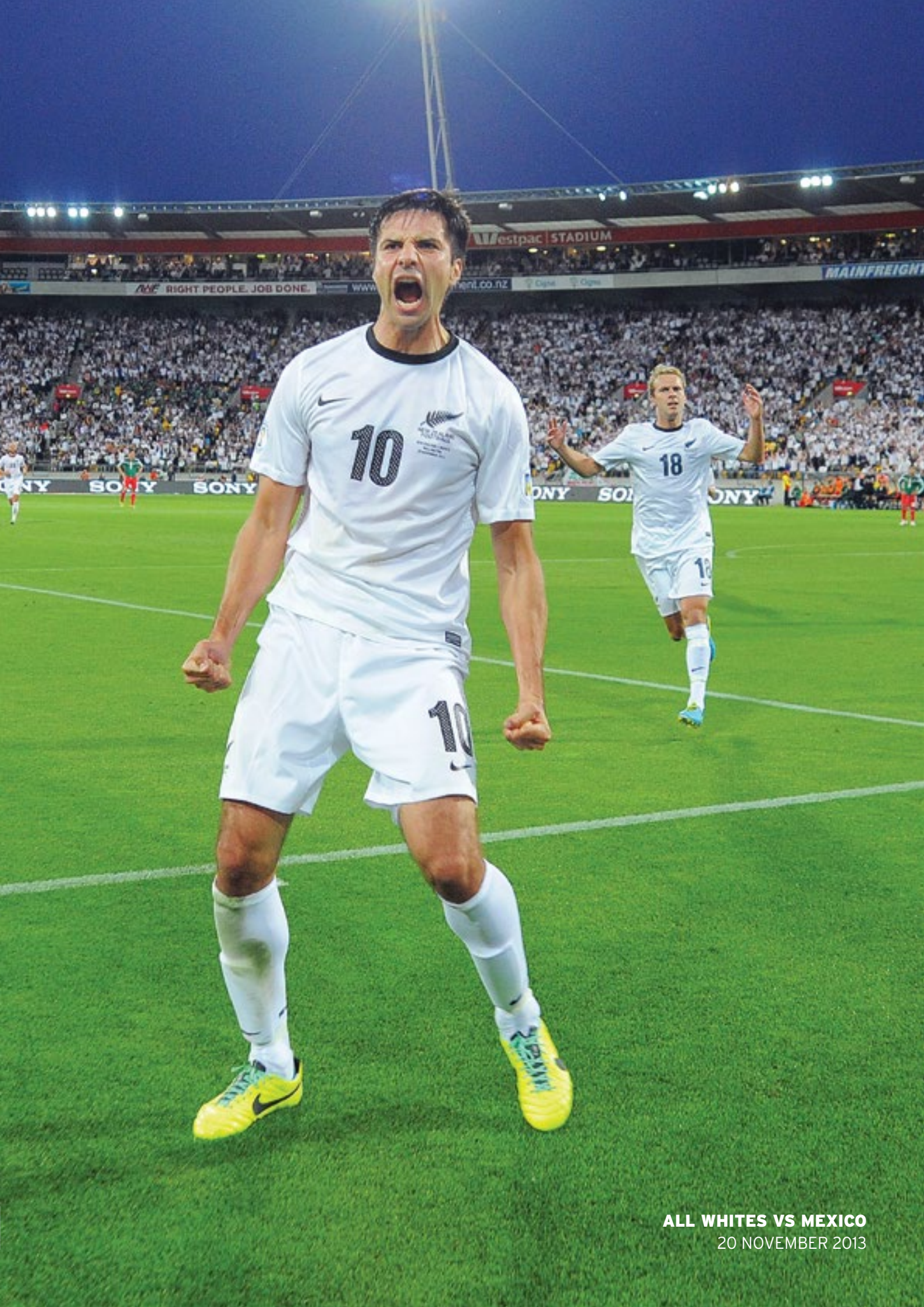
ALL WHITES VS MEXICO 20 NOVEMBER 2013